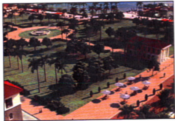
Draft Land Development Regulations October 20, 2009

Planning and Zoning Board Recommendation: The Planning and Zoning Board met on October 14, 2010, and voted to approve the amended CRA Plan, finding that it is in compliance with the Riviera Beach Comprehensive Plan. Final approval of the plan was delayed pending the outcome of voter initiated changes to the Marine District.